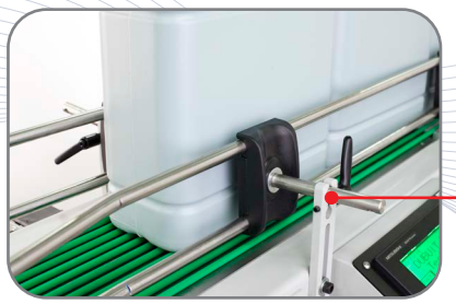
Ajustable conveyor size